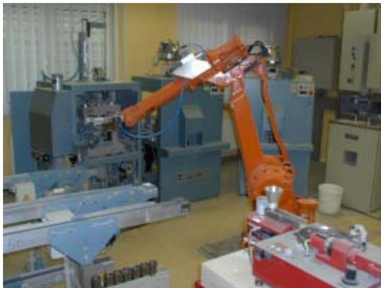
Fig. 3: Robot in the cement laboratory

Thus, it was also possible to successfully and completely commission the modernised laboratory automation system at Dyckerhoff recently. The quality of the overall solution is probably documented best by the fact that Dyckerhoff AG has now decided to modernise a second plant in Göllheim. In this new application, not only the laboratory automation system will be realised in a complete system from ECKELMANN, but also the entire pneumatic post control and processing engineering closed-loop control functions.